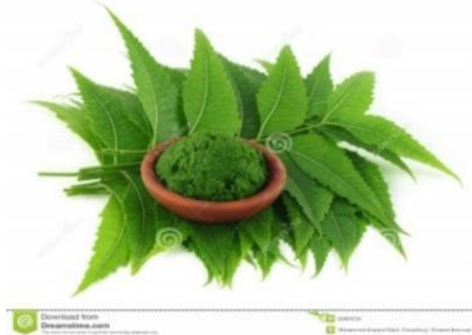
Fig 1. Neem Leaves