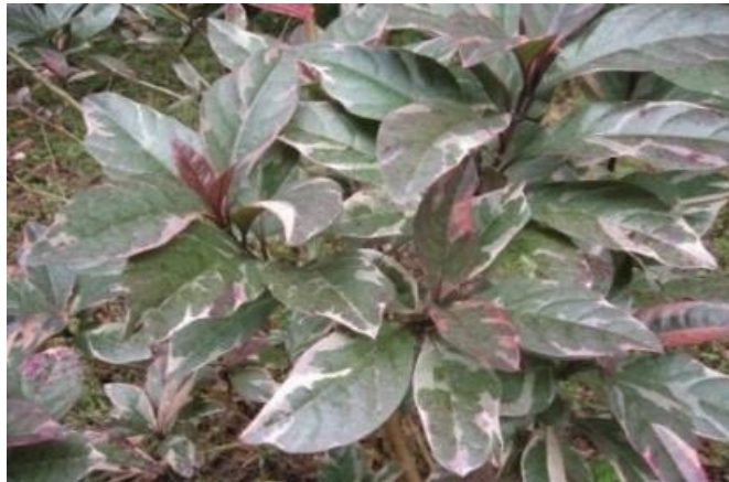
Fig 4. Arenthrum Leaves