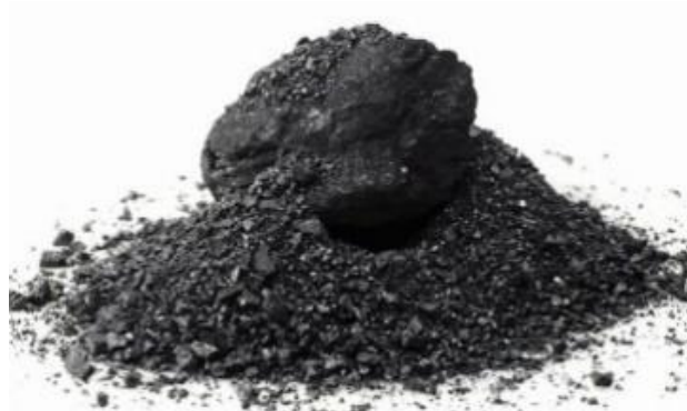
Fig 3. Activated Charcoal