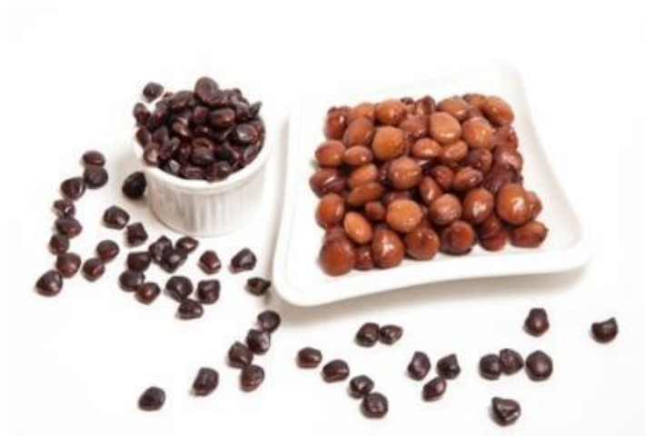
Fig 2. Tamarind Seeds